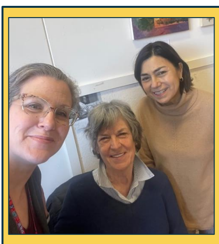
We are here to help!