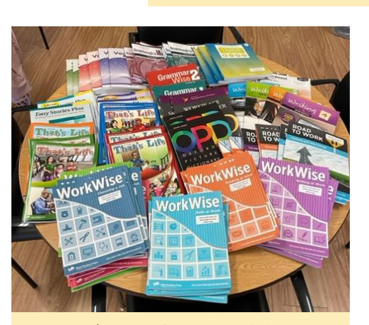
Over $1,000 of new materials was awarded to LVWC from ProLiteracy.