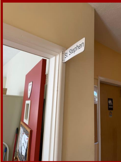
LVWC location 7 Elm Street, Westerly